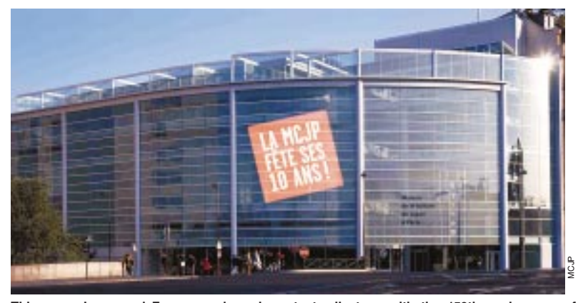
This year, Japan and France mark an important milestone with the 150th anniversary of cultural relations between the two countries. The Japanese Institute of Culture in Paris recently commemorated its 10th year in the French capital.