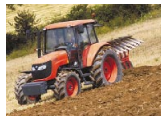
France has remained the biggest market for Kubota in Europe

"We are committed to introducing every year innovative products that meet European standards and to invest in R&D so as to