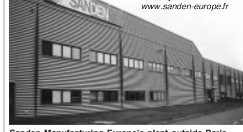
Sanden Manufacturing Europe's plant outside Paris

JEOL's 200 kV field emission transmission electron microscope represents state-of-the-art technology in the field.