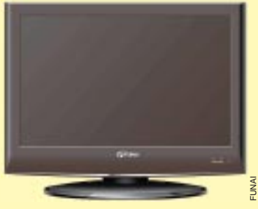
and its competitively priced high-quality products, Funai hopes to be among France's top makers of consumer elec-

"Since our entry into the market, Funai France's main strategy has been to create strong partnerships with key retailers such as to that used with Walmart in the U.S., wherein Funai grew to become the biggest customer